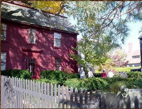
(Nathaniel Hawthorne's house)

Hawthorne was the author of the classic novel, The Scarlet Letter . In 1850-1853, Hawthorne's most productive time, he wrote The House of the Seven Gables , The Blithedale Romance , A Wonder Book (1852), and Tanglewood Tales (1853). Hawthorne is recognized as one of the most important writers of his time.